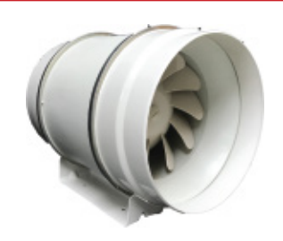
HIGH FLOW MIXED FLOW FAN 200mm